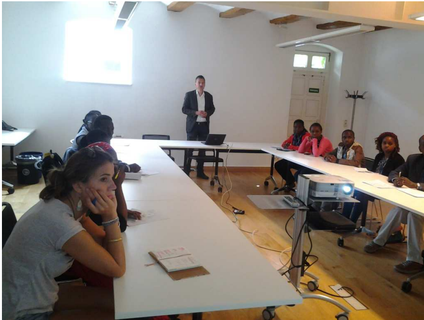
The German and Kenyan students listen to a presentation on Parasitology research at FUB