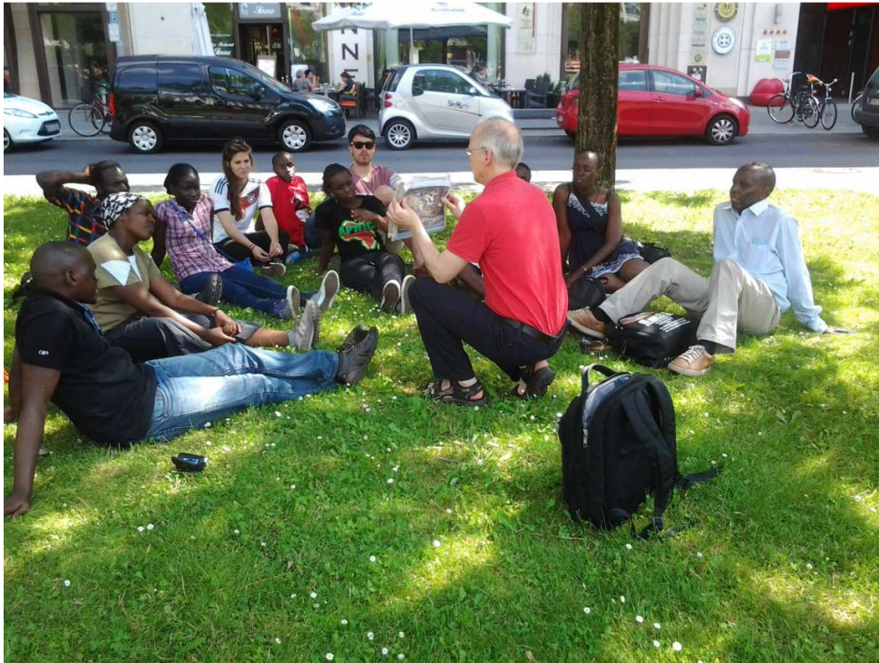
A history lesson on the East and West Germany