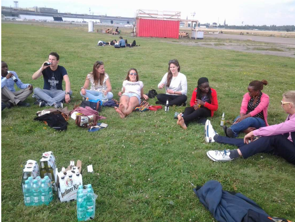
The students have quality time in Berlin