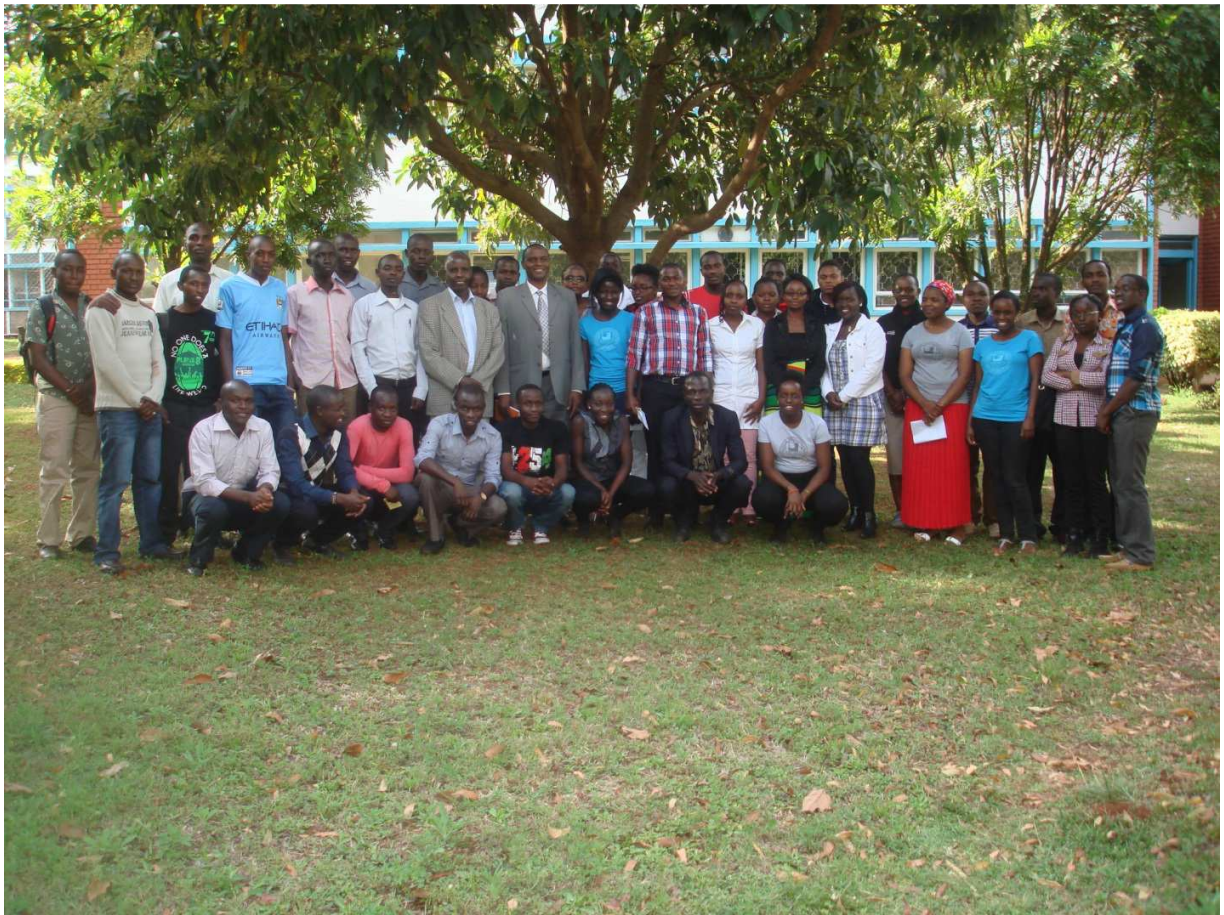
Group photo of students and staff who attended the exhibition on 15-10-2014 at CSD Seminar Room Kabete