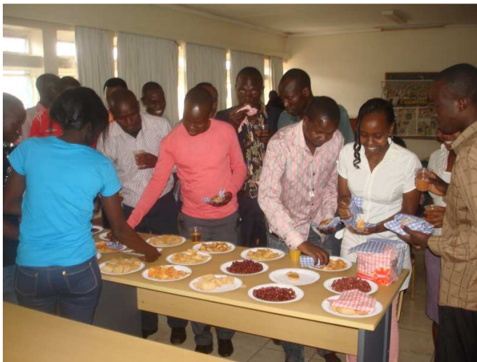
The Students enjoy refreshments during the exhibition