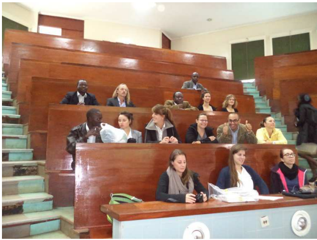
The Students from Germany at the Large animal lecture theatre