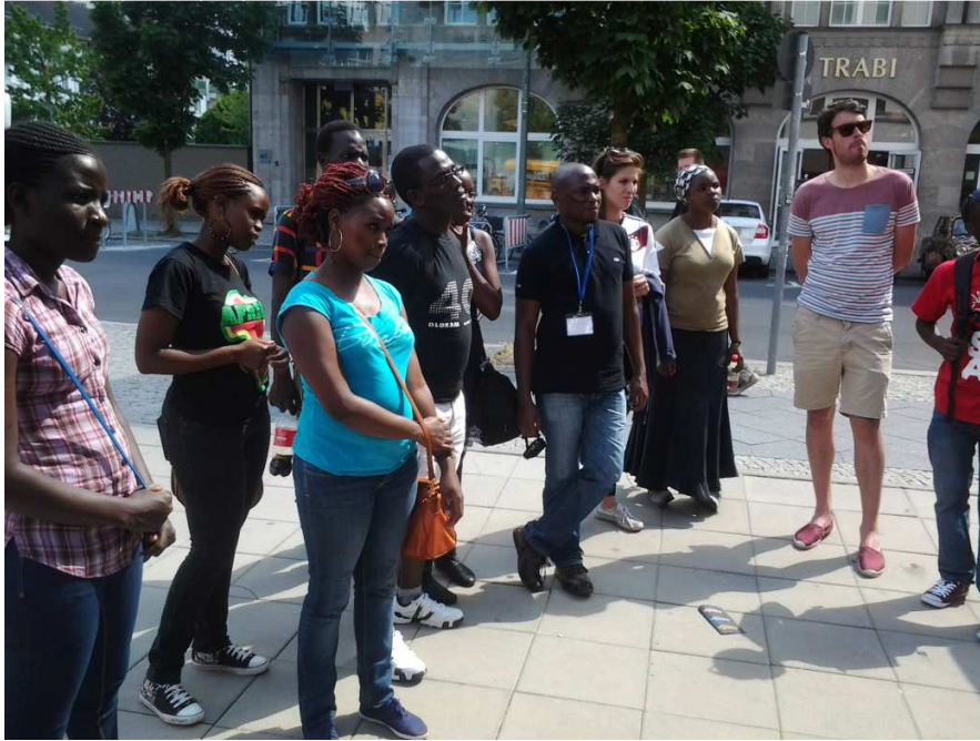
The students enjoy Berlin sights