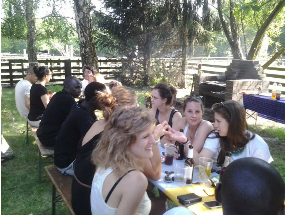
The students enjoy a Barbeque at FUB