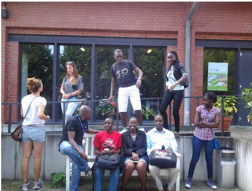
A close up of the students and their German counterparts