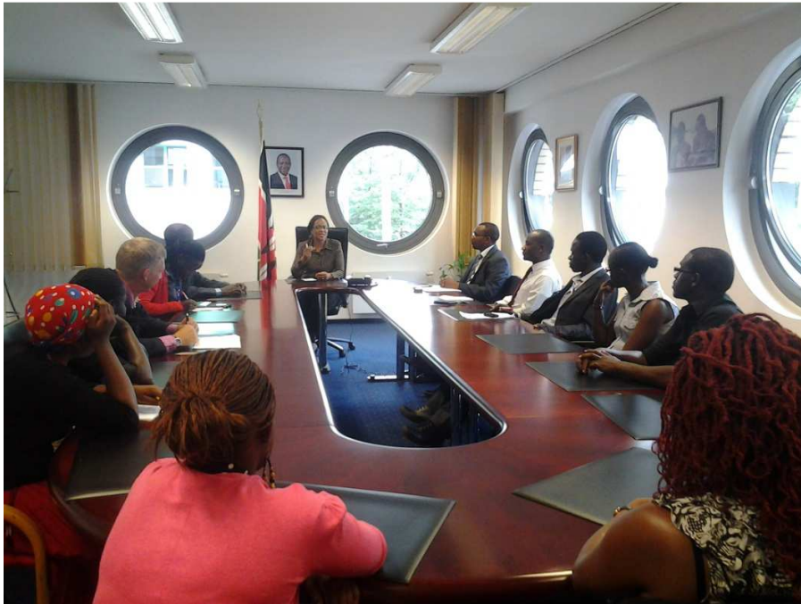
The Student meet the Deputy Ambassador at the Kenyan Embassy in Berlin