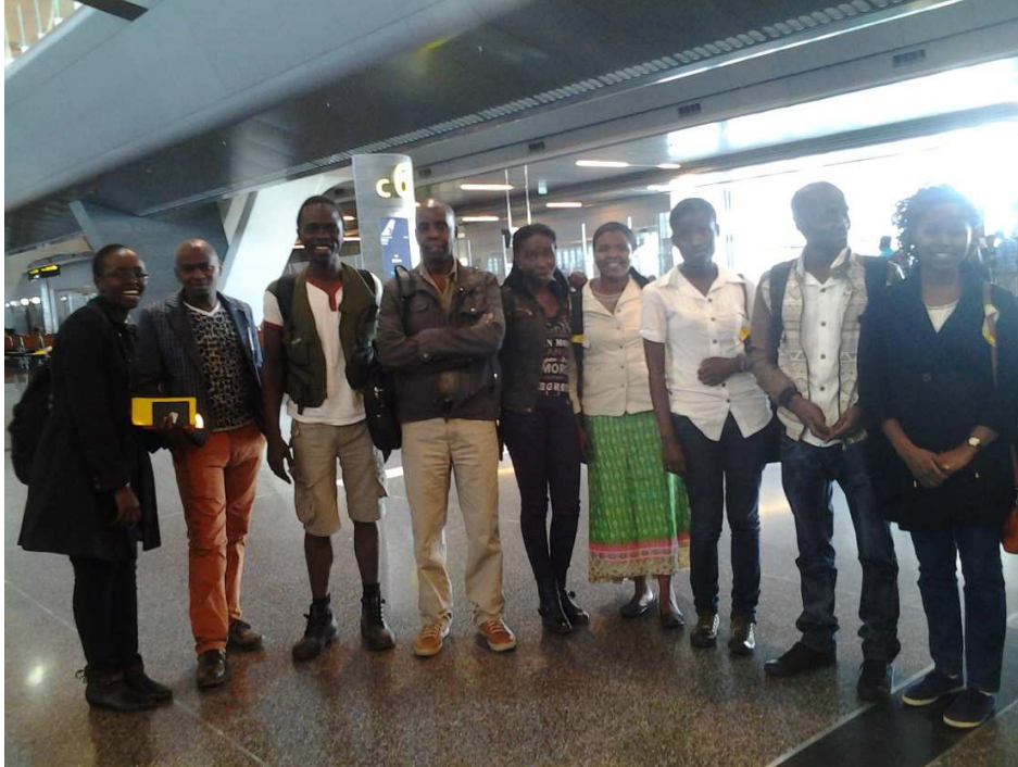
Kenyan student and staff in Doha enroute to Berlin

There were discussions on the possibilities of postgraduate education (practicals, doctoral, MSc theses) and of scholarships through the DAAD or other organisations.