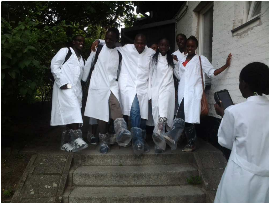
The students visit the cattle holding area