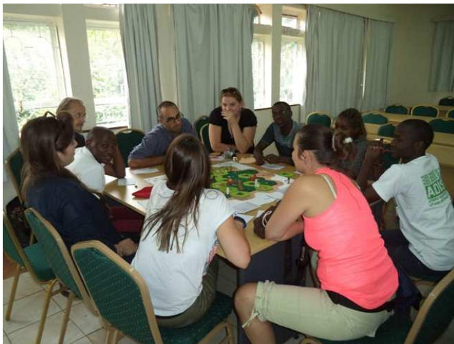
The Kenyan and Germany students play the game on Pastoralists