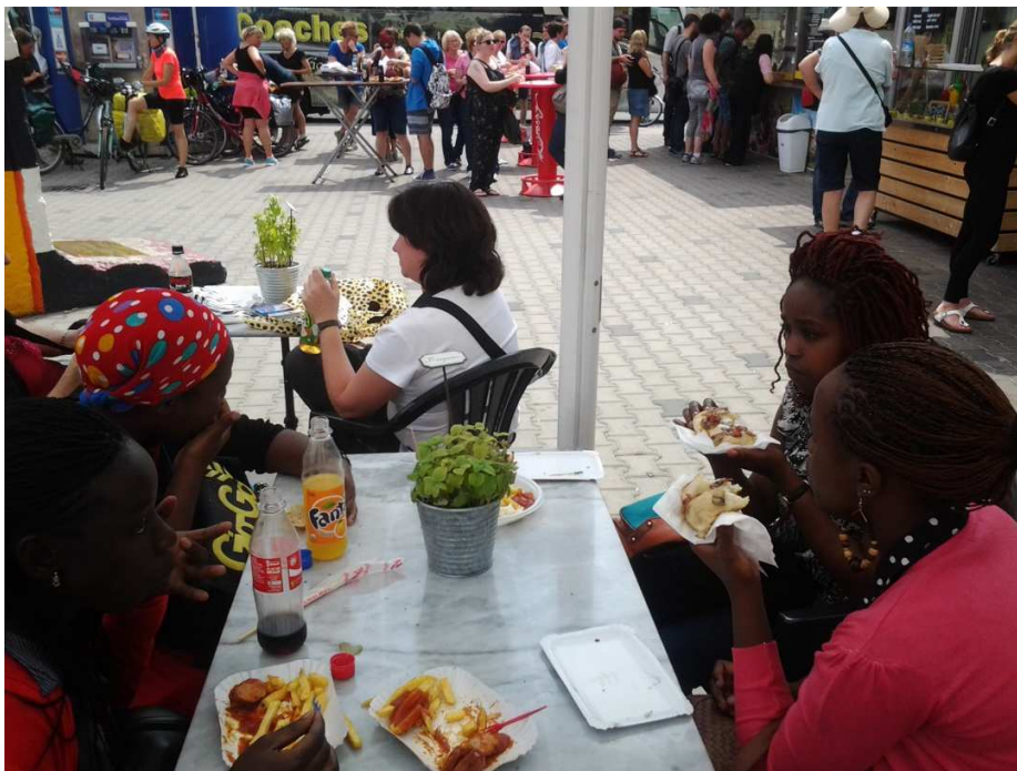
The students enjoy a meal at Alexander Platz in Downtown Berlin