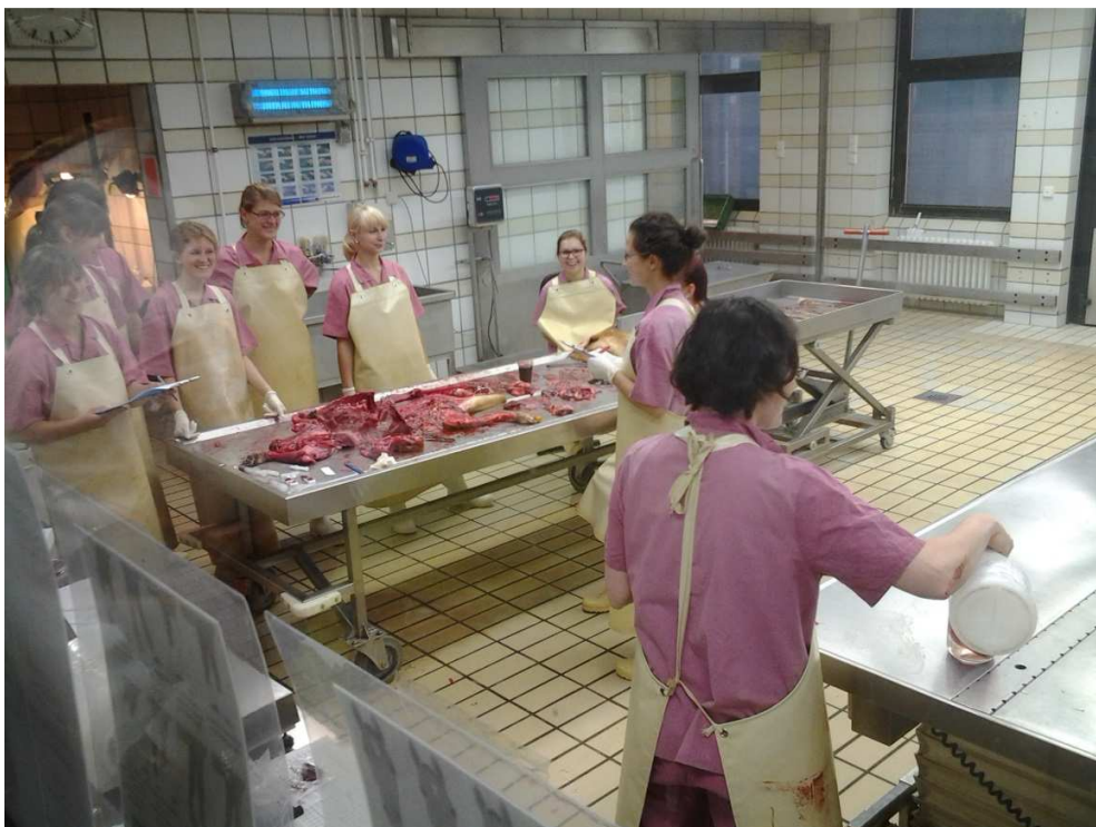
The students observe a post mortem