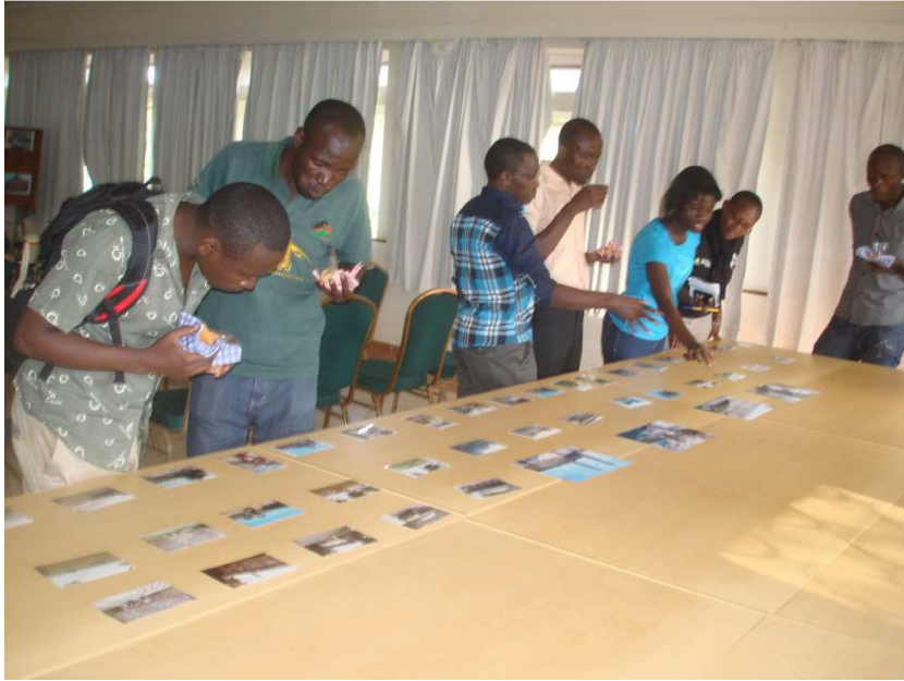
Students admire Images of Berlin on Display