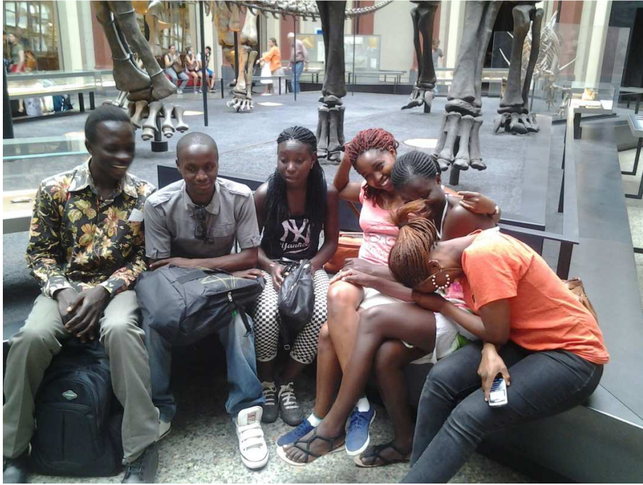
The students visit the Natural Museum