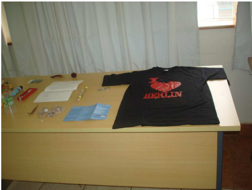
Items on display during the exhibition