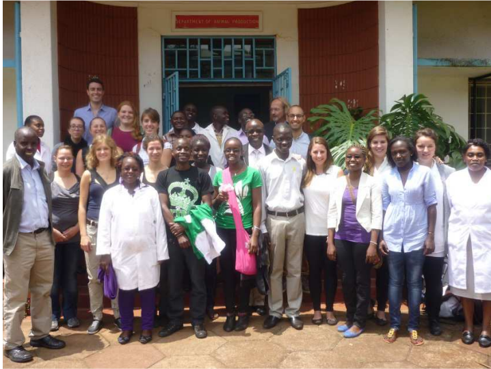
A group photo for the German and Kenyan students