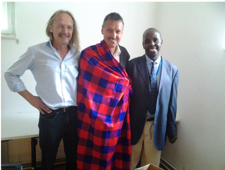
The Dean of Free University of Berlin is presented with a shuka by the students