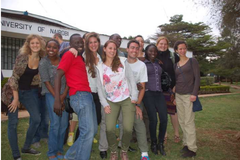
The German and Kenyan students have fun