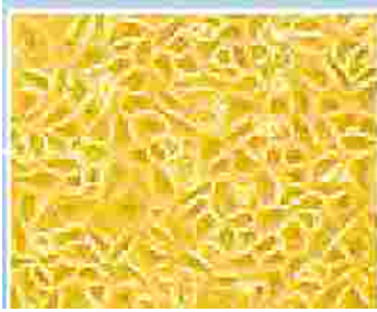
Photograph 2: Normal Cmagi cell (yellow)

Photograph 2 above shows a picture of normal Cmagi cell (yellow)