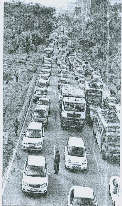
JEFF ANGOTE IN NA

Motorists held up in traffic jam on Mombasa Road in Nairobi yesterday. The new traffic flow plan at city roundabout caused confusion among motorists, creating a major snarl-up. See story on Page 16.