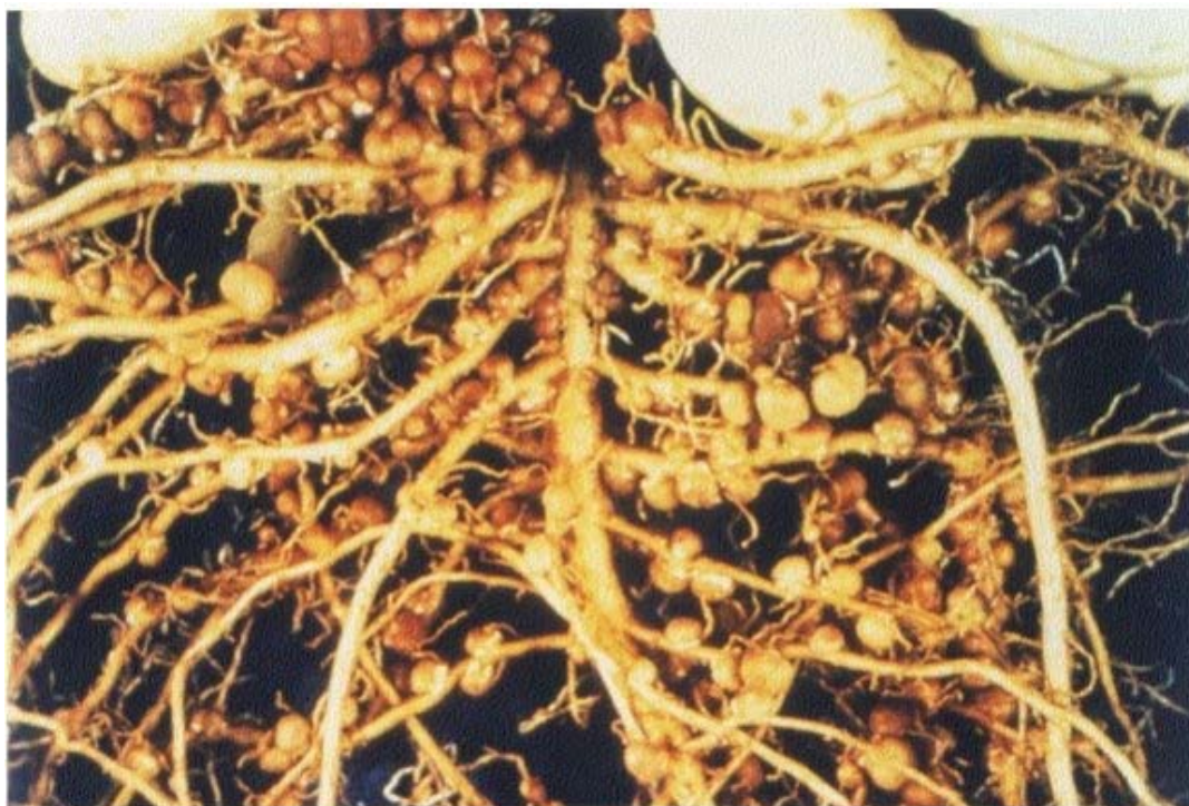
Figure 2. Legume root nodules on soybean.

In the same period (between 1950 and 1990), world fertilizer production increased tenfold, over half of the increase being nitrogen fertilizer applied to cereal crops. Such ready availability of fertilizer nitrogen (at a cost) may have encouraged a spirit of complacency in policy makers, detrimental to the promotion of BNF the resources made available in recent years by governments for BNF in developed countries seem to have been reduced. Despite the huge increase in nitrogen fixation in the past 35 years, most of this has been Industrial Nitrogen Fixation (INF) using fossil fuels to reduce atmospheric nitrogen to ammonia. In 1990, world consumption of fertilizer was 80 million tons. By 2020 (when Kenya hopes to be industrialized) it is anticipated that 160 million tons of nitrogen for cereal production will be required, despite a recent downturn in nitrogen fertilizer use during the early 1990s, mainly as a result of political changes.