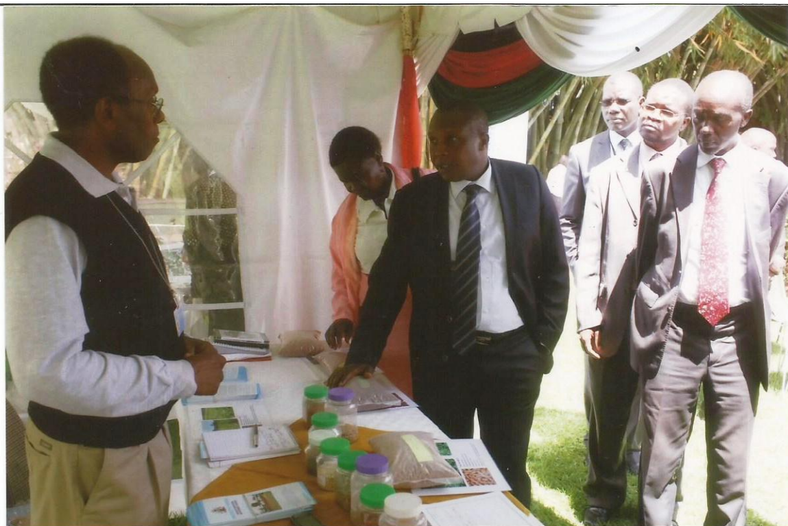
On display were the many seed varieties developed by CAVS at the University of Nairobi