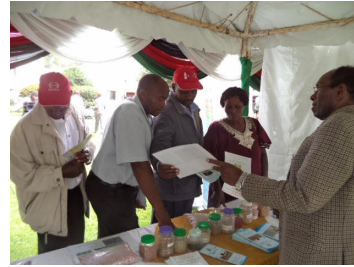
Agricultural extension staffs seek guidance on choosing Masters Degree programs at UON, CAVS stand at Green hills hotel, Nyeri County