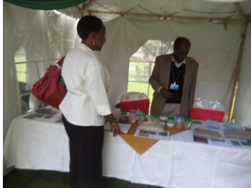
A prospective PhD candidate seeks guidance on doing it by research ad thesis which is in line with the requirements of her employer.