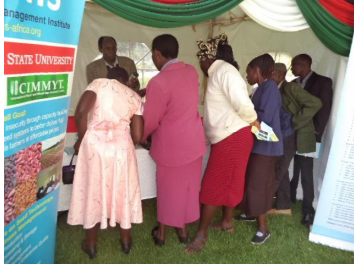
Groups of farmers flock University of Nairobi, CAVS stand to buy seeds during the launch of Agricultural advisory services at Green hills, Nyeri County