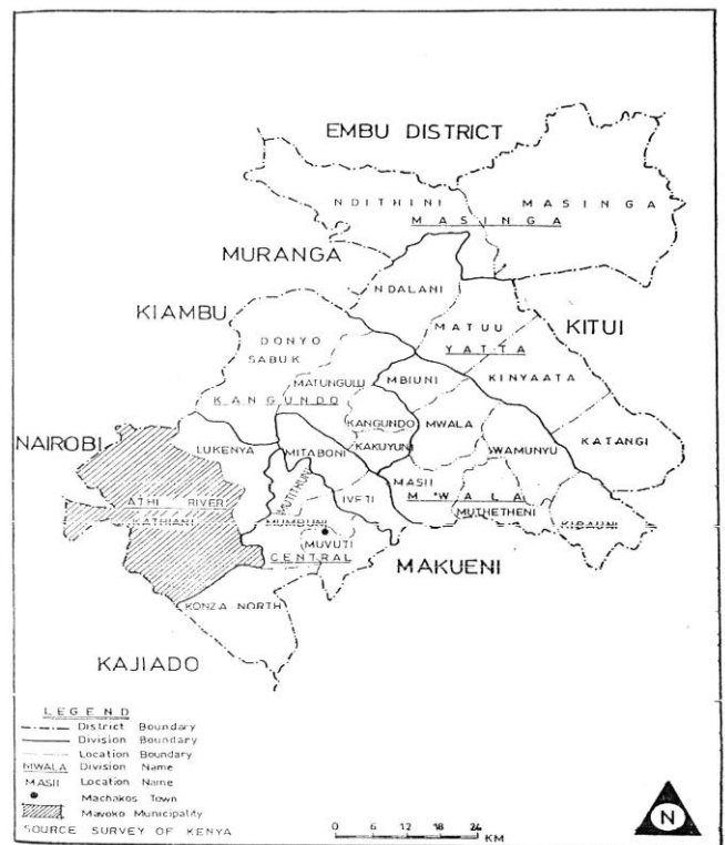
Figure 3.3: Location of Mlolongo Township within Machakos District

For the purposes of detailed and analytical investigations on spatial planning and management needs and requirements for peri-urban settlements of Nairobi City, Mlolongo Township, a satellite settlement of Nairobi, was selected as a sample case study area. Though administratively located in Mavoko Municipality, Machakos District, Mlolongo Township can be, for the purpose of this study, be considered a typical Nairobi peri-urban settlement. It is situated on the North-Western edge of Machakos District, approximately 20km from Nairobi City Centre along the Nairobi-Mombasa Highway. It falls in Syokimau Sub-location, Katani Location, Athi River Division, and Machakos District in Eastern Province of Kenya. The township is located in the south-eastern “ armpit ” of Nairobi City boundary as shown in Figs. 3.3.