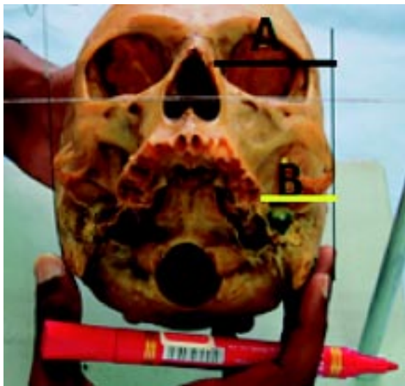
Fig. 4. Difference between Line A and Line B giving the pupil point based on the medial canthus.

The data collected was analysed using SPSS version 20. The results are summarized in Table I below. The length and width was 23.54 mm ( \pm 2.26 ) and the left was 23.49 mm ( \pm 2.16 ) (Fig. 4).