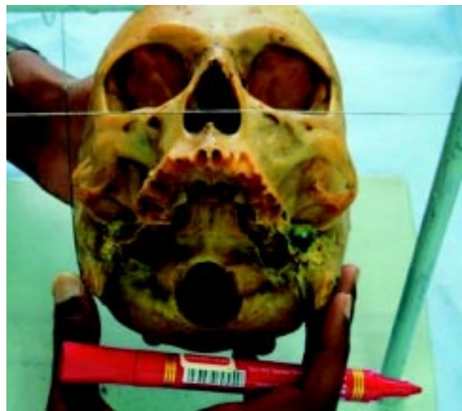
Fig. 2. Measuring frame.

The first measurements made were the length and width of foramen ovale on the right and left side of the skulls. These were the diameters of the widest and narrowest points of the foramina.