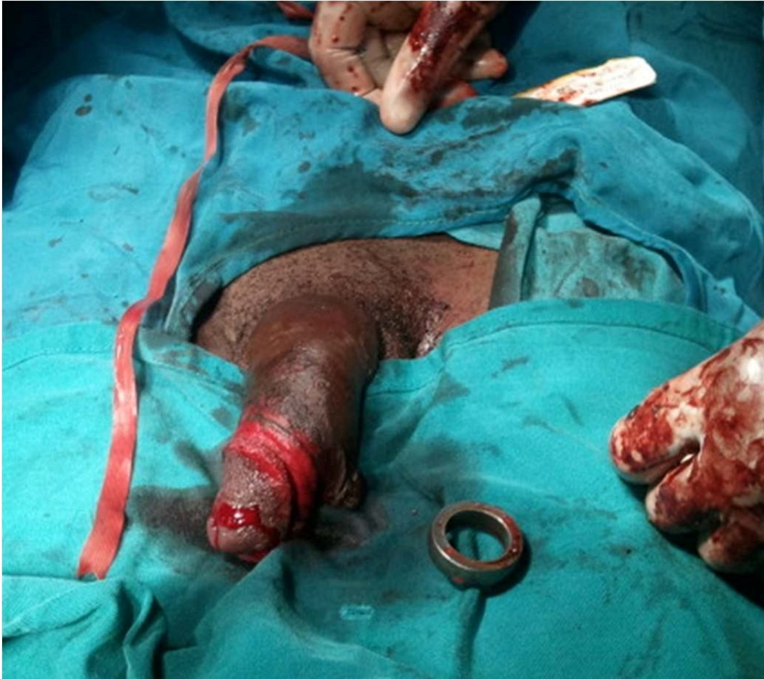
Figure 3 Post op photo of the penile ring alongside a healthy looking penis.