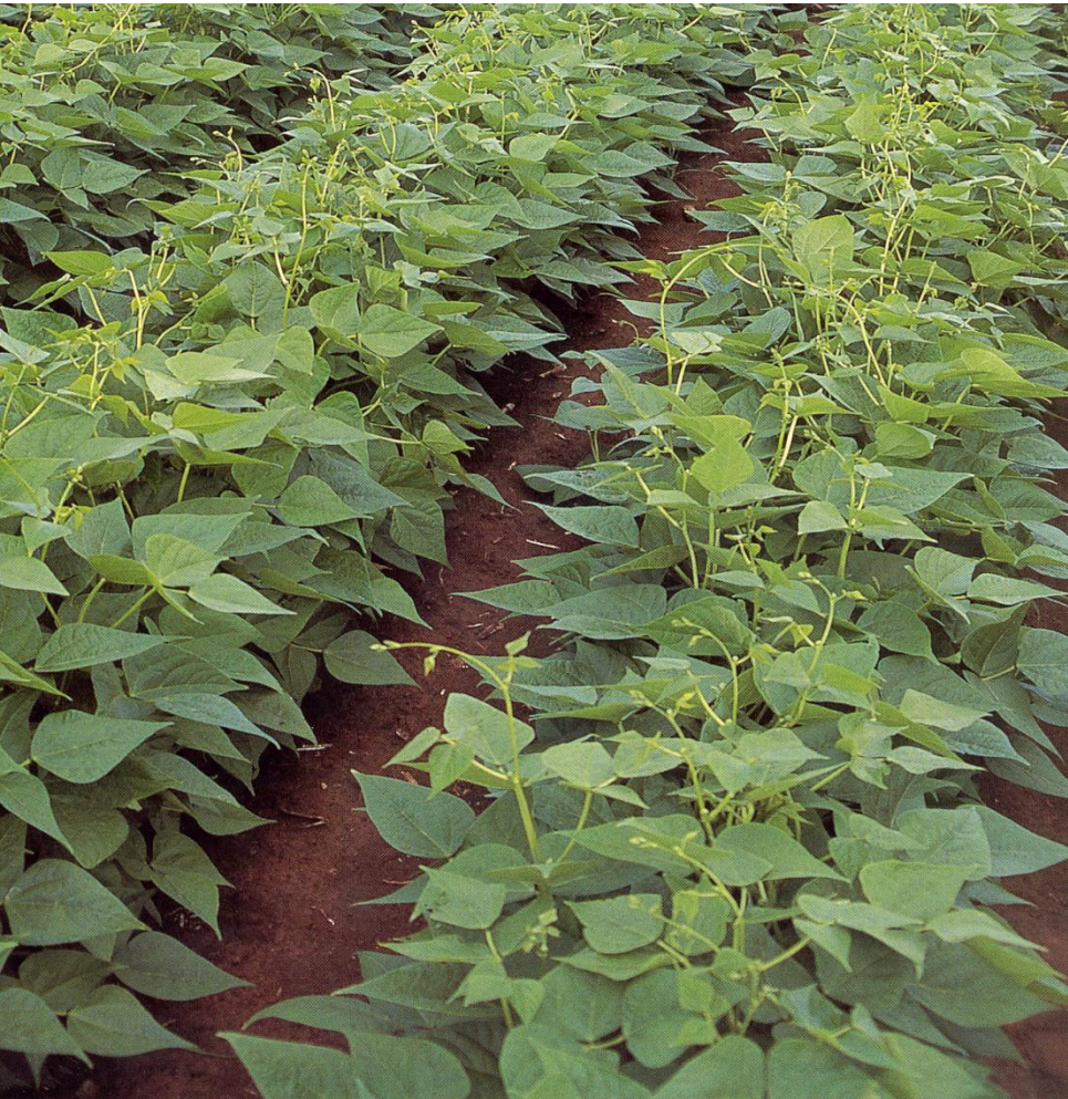
Bean seed crop