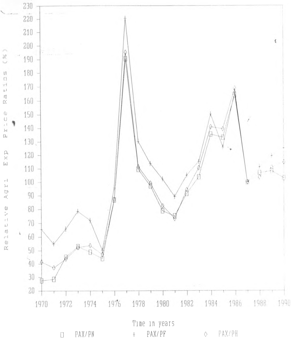
Figure 3: Time Profiles of P_{AX}/P_N , P_{AX}/P_F and P_{AX}/P_H