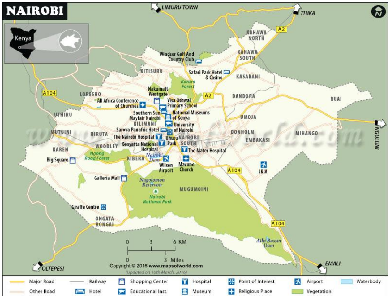
Figure 4.1. Map of Nairobi County

Nairobi county is situated at 1^{\circ} 17'S 36^{\circ}49'E in south central Kenya, 140 kilometers south of the equator. The county is surrounded by 113 sq.km of cliffs, plains and forest. It is adjacent to the eastern edge of the Rift Valley, and to the west are the Ngong hills. Nairobi is the capital and largest city of Kenya with a population of approximately 3 million people living in 17 constituencies.