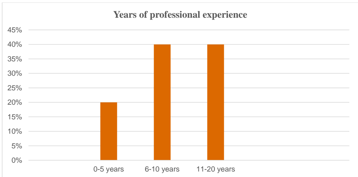
Figure 4.1 General Information on the years of experience

For higher performance companies, superior talent is considered to result in sustained competitiveness (Hiltrop, 1999). With regard to respondents position in the banks, the results show that majority (64.3%) of the respondents were managers in their respective banks while 21.4% of the respondents were heads of departments. These are employees are involved in implementation of competitive strategies and therefore data was collected from these employees